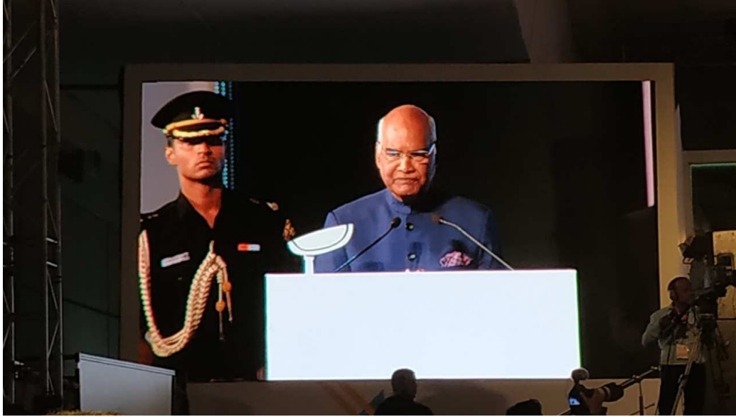
President Kovind address an audience of thousands at the IISF.

Appreciating the progress of India's frugal innovation in engineering and design, the President said that the 'Jugaad' mentality attributed to Indians has its own role to play in the growth of science, and is "something important and worth encouraging."