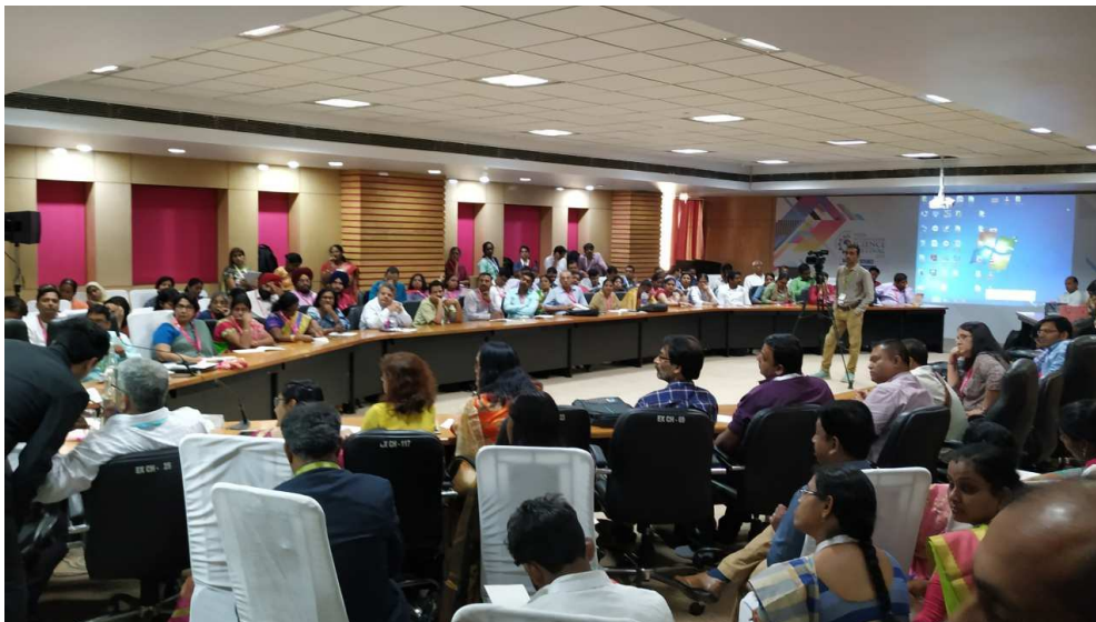
The STAR education roundtable on Day 2 of the IISF.

The session dwelled largely on input from educators on what works and doesn't at the level of schools and educational institutes.